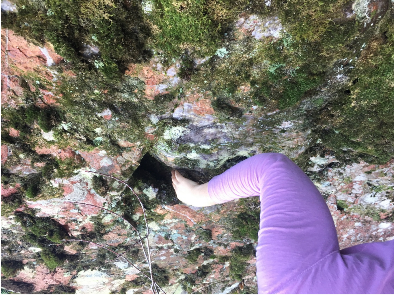
Vertical rise wall