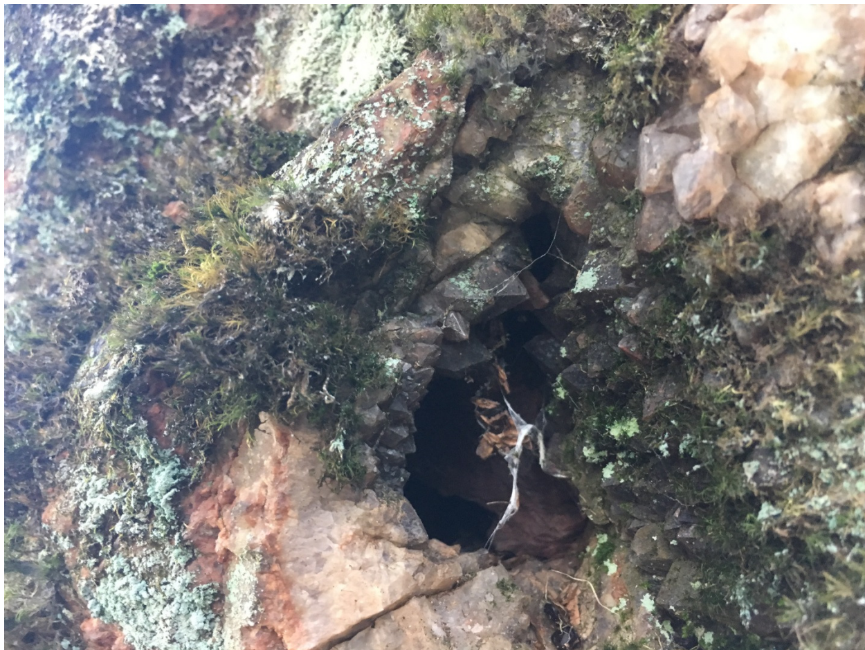
Vug with larger crystals