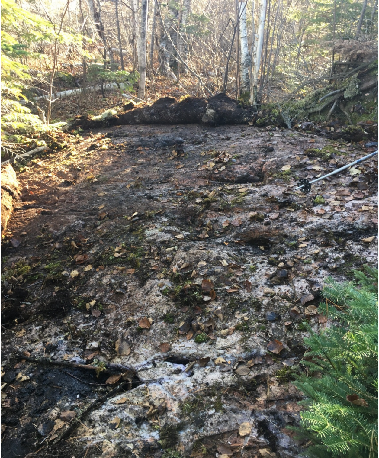
Vug in forefront of pic.