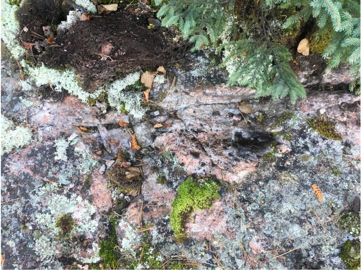
Small vug and veins