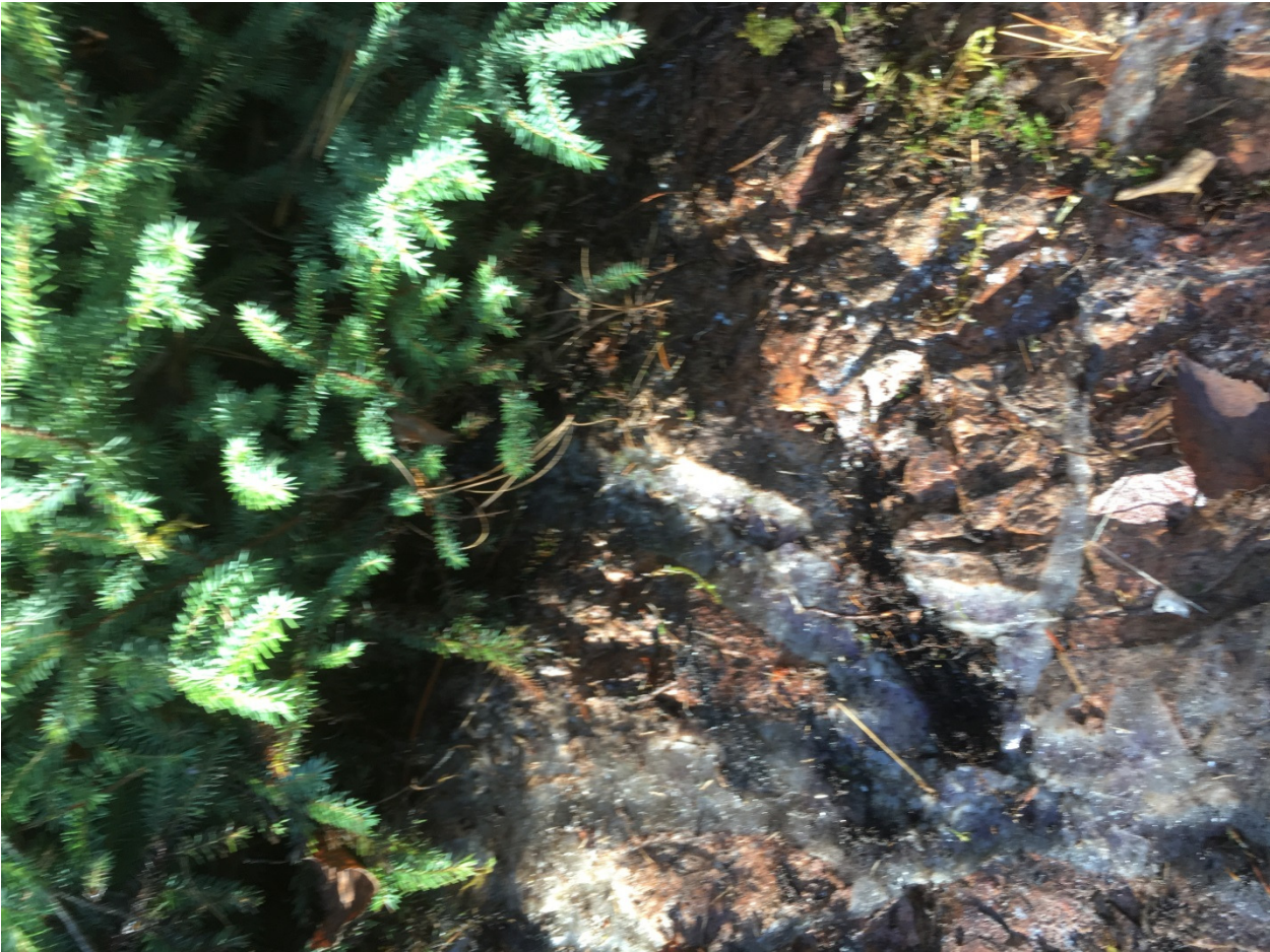
All directional vein