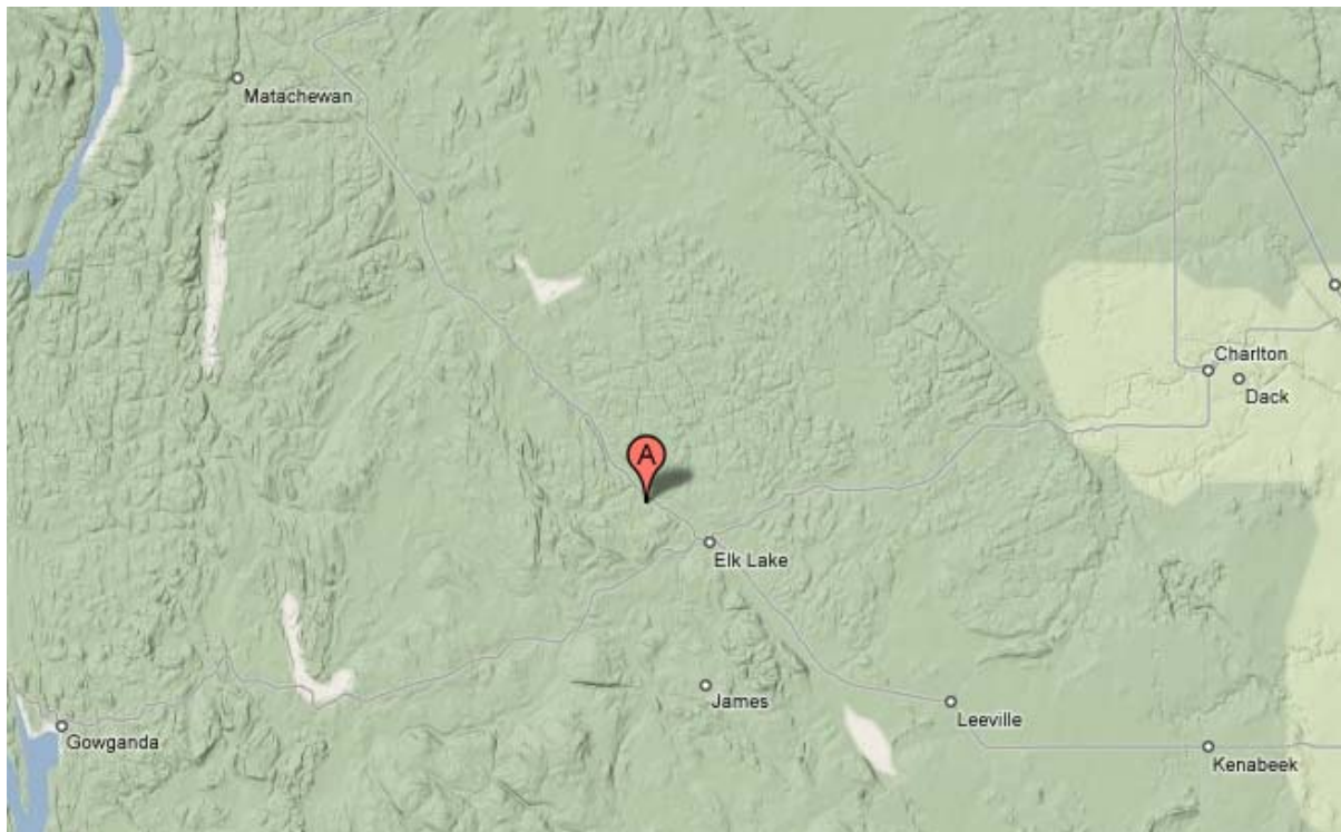
Figure 1: Location of the Elk Lake Property

The Elk Lake Property is located in James Township approximately 2 km southwest of Elk Lake, Ontario. The survey area covers parts of claims numbered 4240784 and 4273173 located in James Township, within the Larder Lake Mining Division.