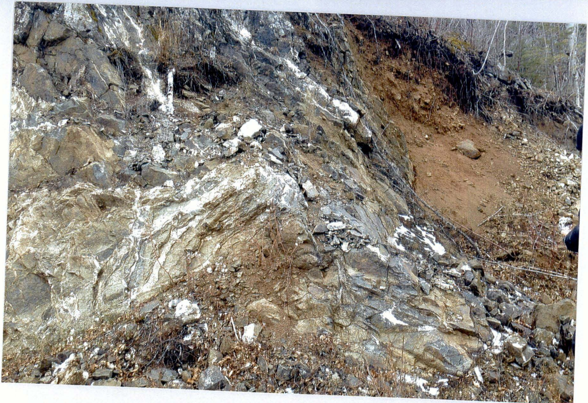
Center D/c. (looking North)