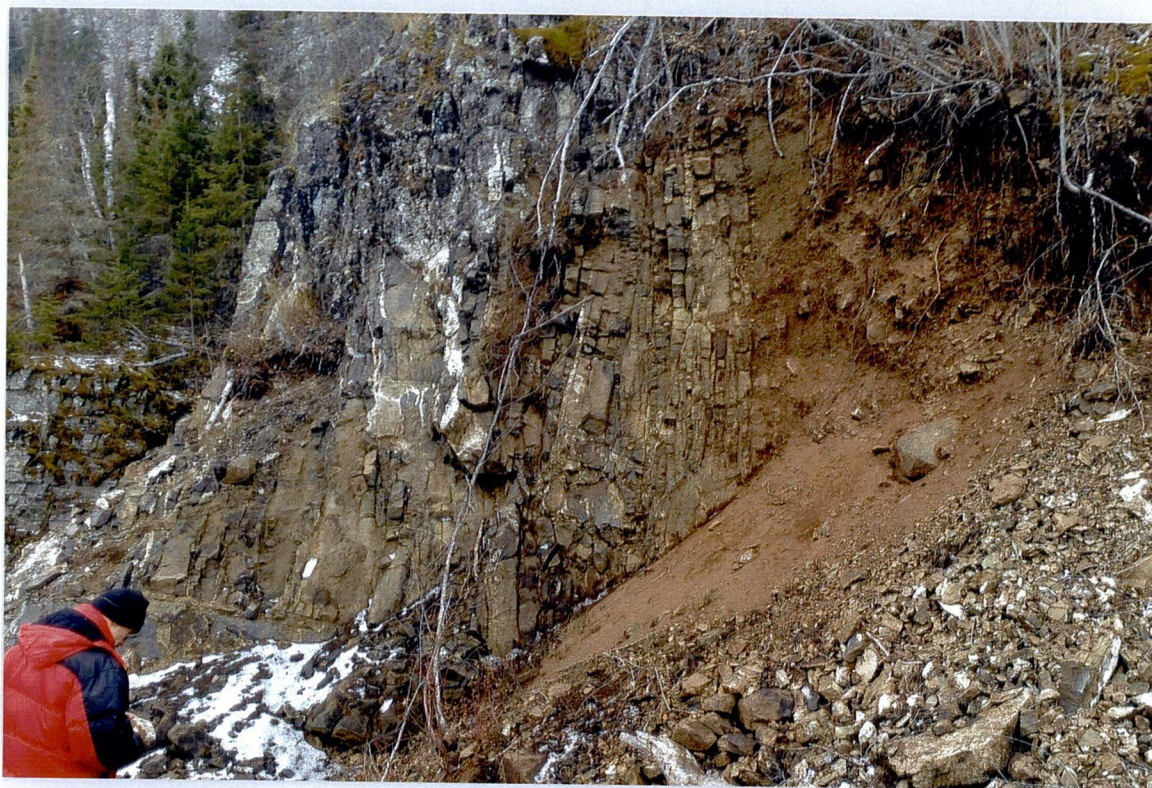
Northside D/C (looking west/south)