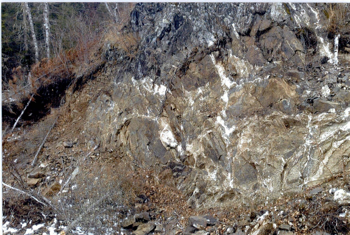
Southside D/C (looking southwest)