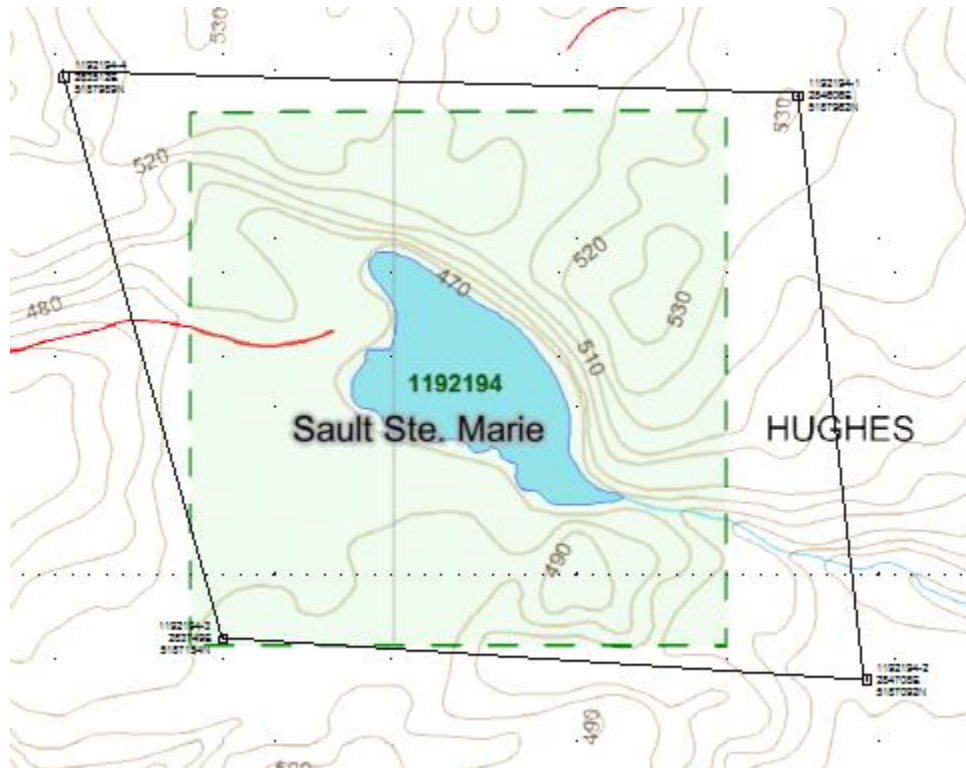
Figure 2: Boundaries Rehabilitated of Mining Claim