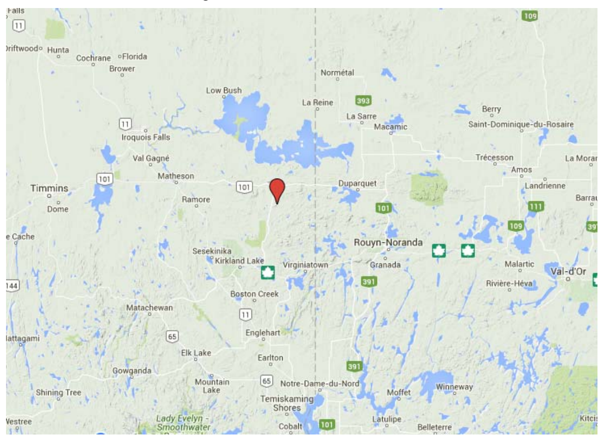
Figure 1: Location of the Harker Heritage Property

The Harker Heritage Property is located approximately 50 km northeast of Kirkland Lake, Ontario. The property consists of 375 mining claims comprising of over 850 units spanning Clifford, Elliot, Harker, Holloway, Tannahill and Marriott Townships within the Larder Lake Mining Division.