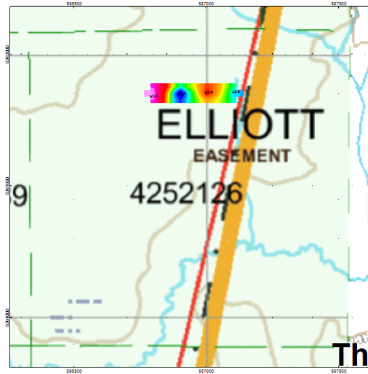
Figure 2: Spectrometer Readings

Area 3 represents a short 0.375 km east-west traverse with no outcrops being observed.