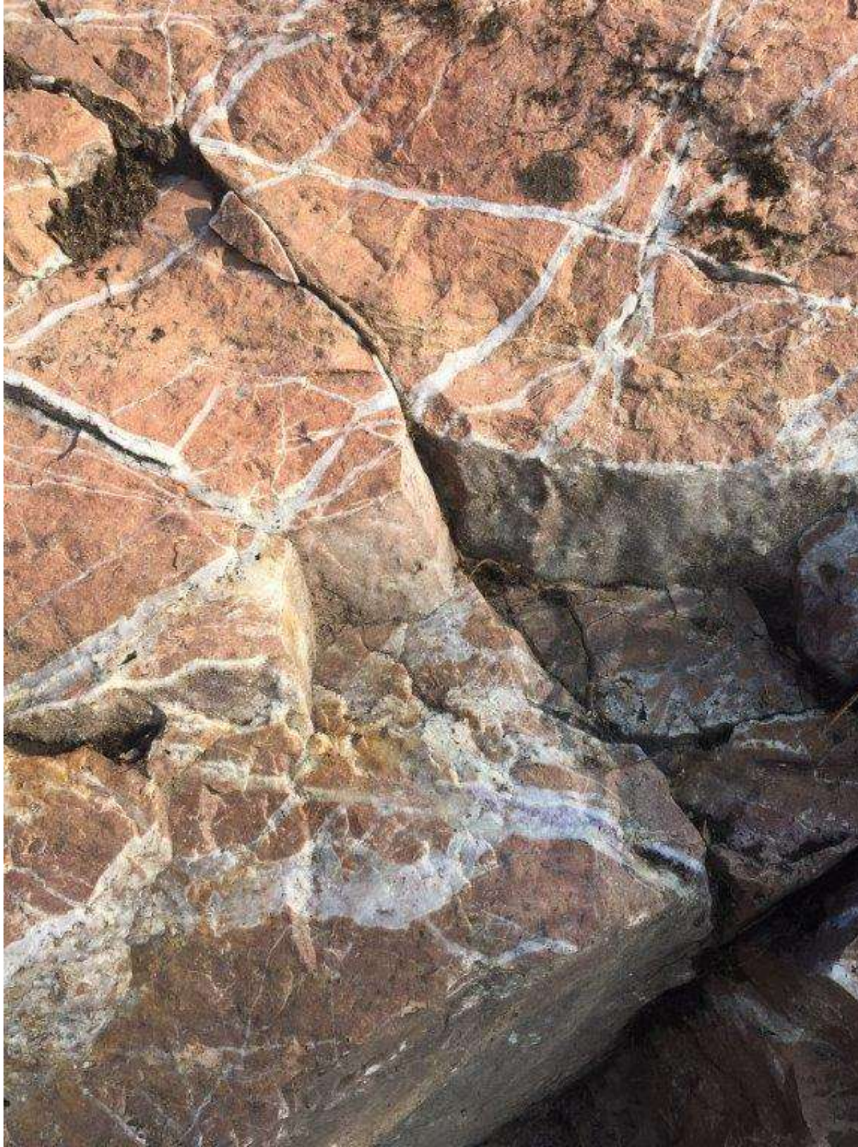
Picture #3 - white quartz veins with granite matrix at centre of work area