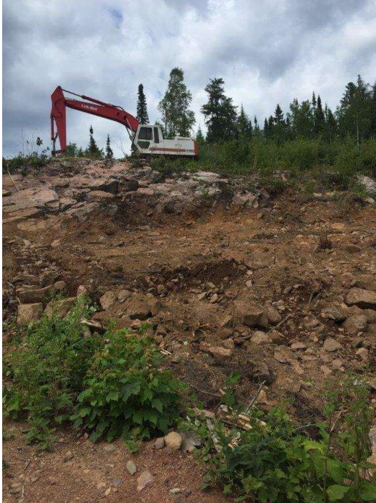
Picture #5 - overview of central work area, previous pictures all taken in this area