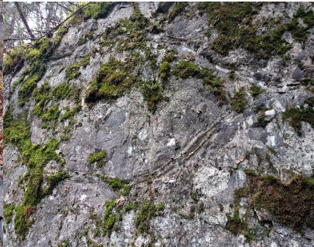
Photos: Clarice Lake, Old Pit, Pillowed lava near pit