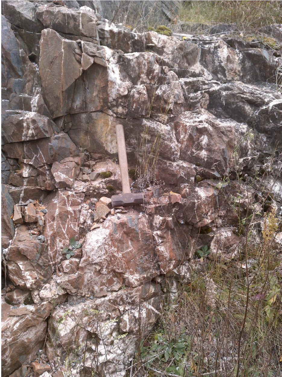
Rock Cut along HWY 71