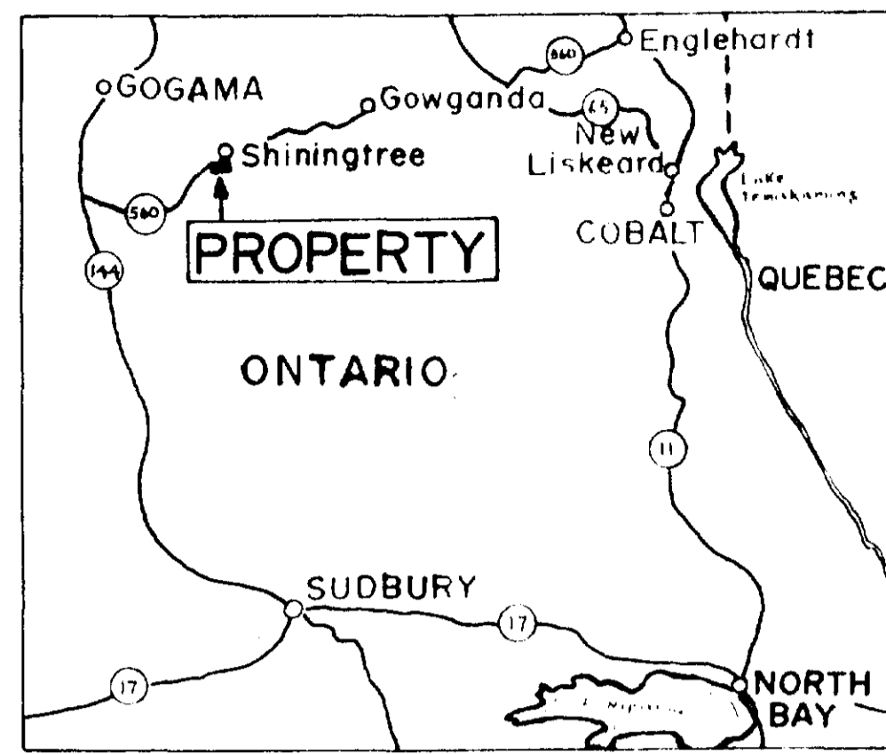
INDEX MAP - SCALE: 1" = 28 MI.